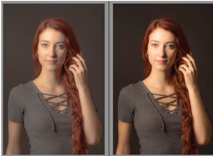
^ Figure 1: A low contrast (left) vs high contrast (right) image.

How much contrast can we perceive? An incredible amount it turns out. Our eyes can perceive about nine orders of magnitude in brightness sequentially from about 1/1000th Lux 1 (moonless, overcast night sky - starlight) to 100,000 Lux (direct sunlight), but not all at the same time. Because this range of brightness in the real world is so very large, our eye brain system reacts logarithmically with an adapted S-shaped response curve and that is one way that our human visual system adapts to the environment and objects it is seeing.