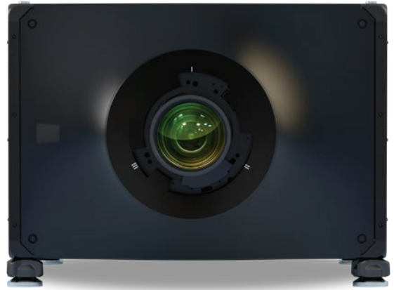
^ Christie® D4K40-RGB and Mirage 4K40-RGB provide an exceptionally wide color gamut and a 5000:1 On/Off contrast ratio.

True on-off (sequential) contrast ratio is a good measure to see what the potential of the system is. If a rising average picture level (APL) brightness is also factored in the measurement, this is the most useful and accurate method to try to quantify real-world performance.