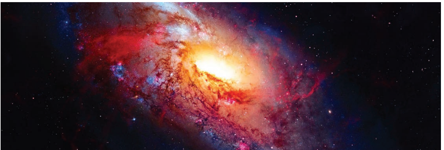
^ Figure 4: True HDR RGB laser projection systems produce true blacks without any residual light so you cannot see the edge of the frame, nor any blend zones on multi-projector arrays.