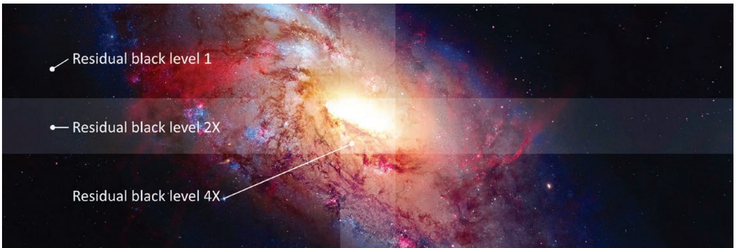
^ Figure 3: An illustration of various residual black levels and blend zones.

2 Read the Resolution matters tech brief here for more detailed information.