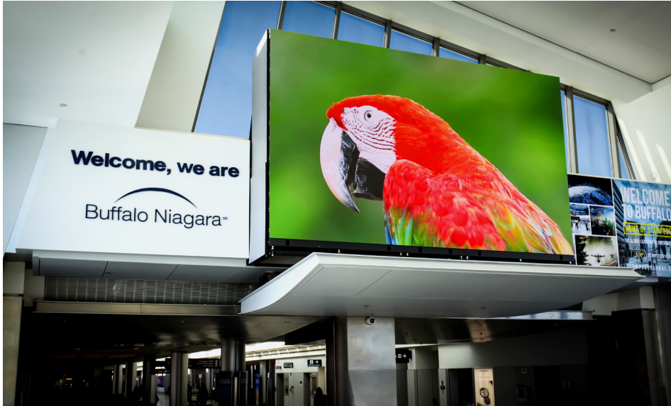
▲ A massive 300 square foot video wall made up of Christie Velvet LED tiles creates a seamless, vibrant display

Stampede partnership takes airport signage to a bright new level