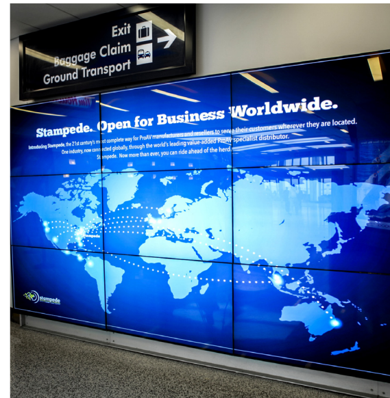
▲ Narrow-bezel Christie 55" LCD panels in a 3 x 3 configuration create a bright and brilliant video wall

Contact us today to see how your company can benefit from our leading-edge display solutions.